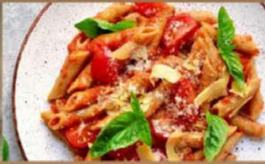
THURSDAYS Pasta + Wine