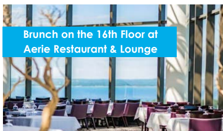
Brunch on the 16th Floor at Aerie Restaurant & Lounge