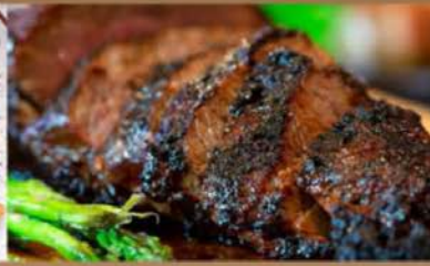
FRIDAYS Beef Tips + Bourbon