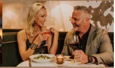
SATURDAYS Date Night