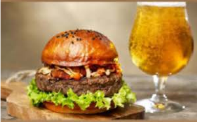
WEDNESDAYS Burger + Pint